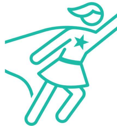
Get It Done