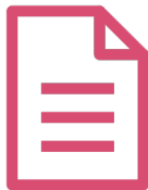
Business Area 1 pager