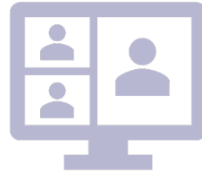
Business Engagement Templates & Processes