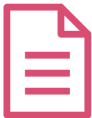
Business Area 1 pager